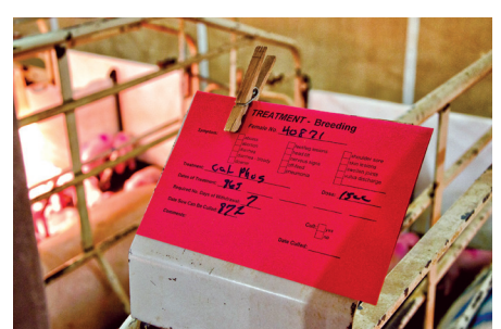
If any medical attention or prescription was given, the sow will have a red card, so this can be seen at a glance.

Everything at lowa Select Farms is geared around having attended litters.