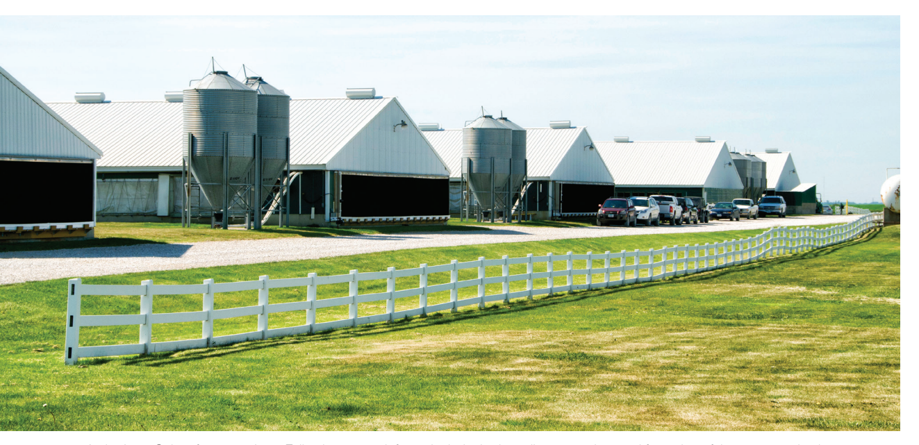
At the lowa Select farm near lowa Falls, the sow-unit farms include the breeding, gestation, and farrowing of the mature animals.

where needed, and provide individual sow and piglet care. "Everything is geared around having attended litters," Nydegger said.