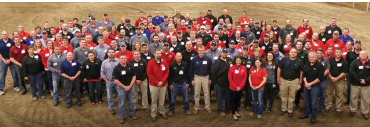
Iowa Select Farms Production Management Team

The survey measured several aspects of each workplace including organizational health and individual job satisfaction such as employee confidence in employer management and business strategy, company culture and appreciation of employee contributions to company success.